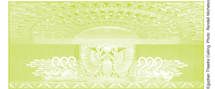
Egyptian Theatre Ceiling.

The American Cinematheque is a non-profit 501 (C) (3) organization.