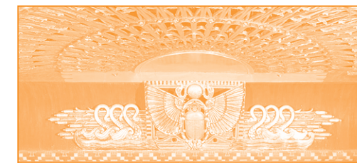
Egyptian Theatre Ceiling

The American Cinematheque is a non-profit 501 (C) (3) organization.